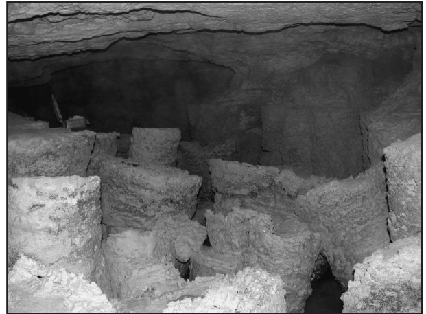
Figure 3. “Conga drum” stromatolites in Dream Cave.

Dream Cave in Ozark County is managed by The Missouri Caves and Karst Conservancy in cooperation with the Ozark Highlands Grotto in Springfield. Dream Cave is quite interesting geologically. In one passage a large number of stromatolites have weathered out of the bedrock and resemble a motley collection of conga drums (Figure 3). What would otherwise be an easy walking-